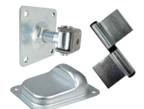
Various Gate Hardware

Please contact us and we will be happy to assist you and discuss your application