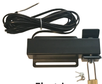
Electric Gate Lock