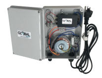
Power Supplies for Mag Locks & Batteries

Please contact us and we will be happy to assist you and discuss your application