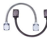
Cable Protectors for securing and hiding cable