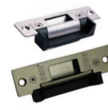
Electric Door Strikes 12/24V