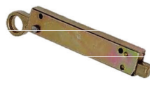
Mechanical 'shoot bolt' for securing swing gate leaves