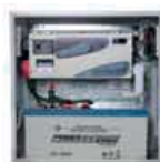
230V UPS Backup for power outages