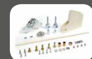
■ Articulation kit