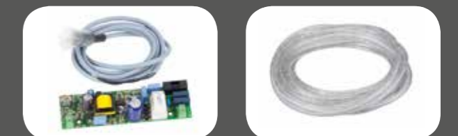
■ Boom light connection kit ■ Luminous cord 5 m