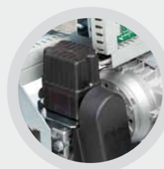
Four integrated mechanical limit switches with fine adjustment to guarantee precise deceleration and end of run positions. Belt plastic protection to prevent finger injury.