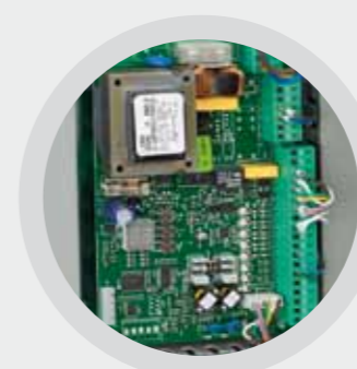
Integrated full feature control panel, easy to program through display and buttons, n°2 loop detectors control built in, full range of operating logics available (including logic PE). Control panel protected with metal housing and transparent cover to help service and maintenance.