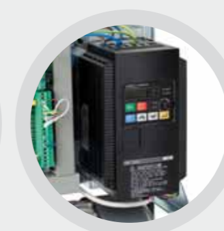
1.5KW power inverter integrated, easy to program permits to adjust precisely speeds, rump-up and rump-down times.